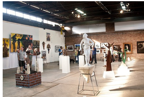
Left: TFA Signs warehouse transformed! (5501 N Kedzie)

The North Park Art Walk was a rousing success with almost 1000 attending the 2-day inaugural event. Local business owners lent vacant space and storefronts that were magically converted to nine fine art galleries on Kedzie and Bryn Mawr.